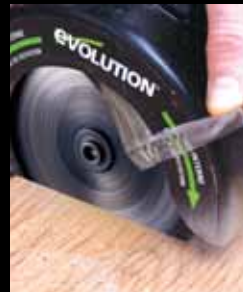
LAMINATE WOOD FLOORING

DOUBLE BLADE SYSTEM GREATLY REDUCES KICKBACK