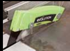
CUTS 3MM STEEL PLATE