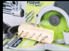
CUTS WOOD WITH NAILS

A DIY ENTHUSIAST'S DREAM - TREMENDOUS VALUE WITH EXCELLENT PERFORMANCE