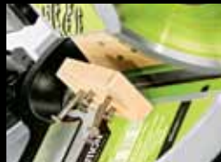
CUTS WOOD WITH NAILS