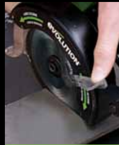
CUTS 3mm MILD STEEL PLATE