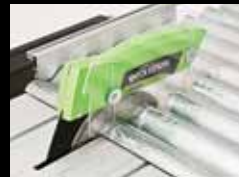
CUTS ALUMINIUM SHEETING