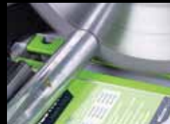
CUTS STEEL PIPING