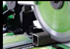
CUTS STEEL BOX SECTION