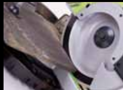
OPTIONAL TILE CUTTING BLADE

300MM SLIDE FOR LONG ANGLED CUTS AND A POWERFUL 2000W MOTOR