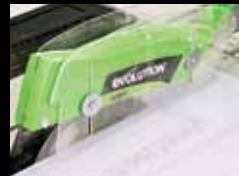
CUTS PLASTIC & PERSPEX

THE WORLD'S FIRST MULTIPURPOSE TABLE SAW